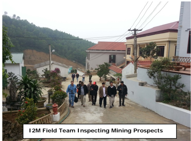
I2M Field Team Inspecting Mining Prospects

3) The local inhabitants are very supportive of new mining activities and appreciate new investments that benefit all, including the local inhabitants through new and well-paying employment, new business for shops. new training opportunities, and local representation to assist in developing Vietnam's natural resources and in protecting their environment.