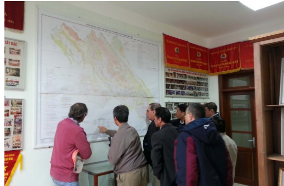
I2M Mining Team at Regional Mines Department

Vietnam mineral resources are widely under-explored and undeveloped. Basic geological mapping of Vietnam has been established in most parts of the country by previous Russian and Chinese geologists and engineers, which has been improved and expanded considerably since the 1980s by Vietnamese geologists through major funding support from various Vietnam governmental offices and with person-nel support from the major universities in Vietnam.